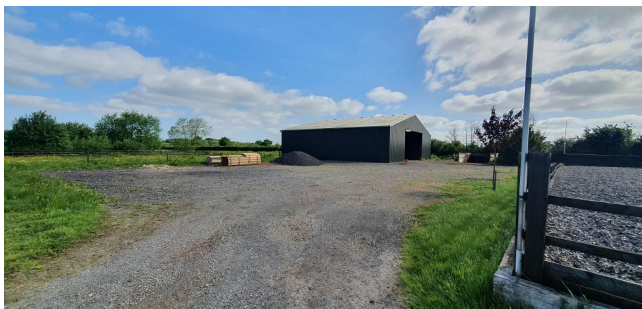
Figure 2: photograph of the agricultural building

The barn measures 20.6m wide x 20m deep and is 8.4m in height to the ridge and 6m to the eaves. It is enclosed along three sides and has an opening 8.8m wide along the front (south) elevation. It has a green profile sheeting finish. A photograph is provided in figure 2 below.